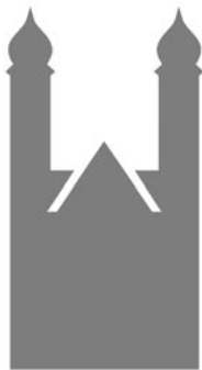
Roggenburg Monastery Museum