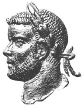
Kellmünz Archaeological Park