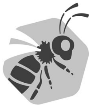
Illertissen Bavarian Bee Museum